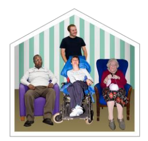
Care Homes and Day Centres

Care Opinion is a website. It has stories on it from people who have used health and social care services.