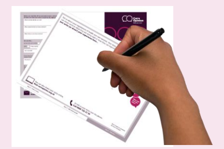
Fill in the Care Opinion feedback card